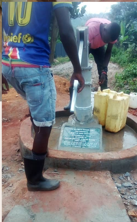
Village children and adults enjoying the new water well